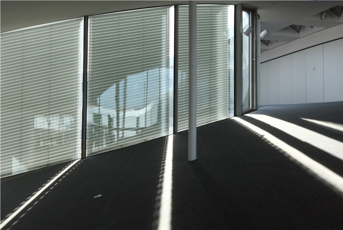
Adreina Schoeberlein / CC BY-NC-ND 2.0