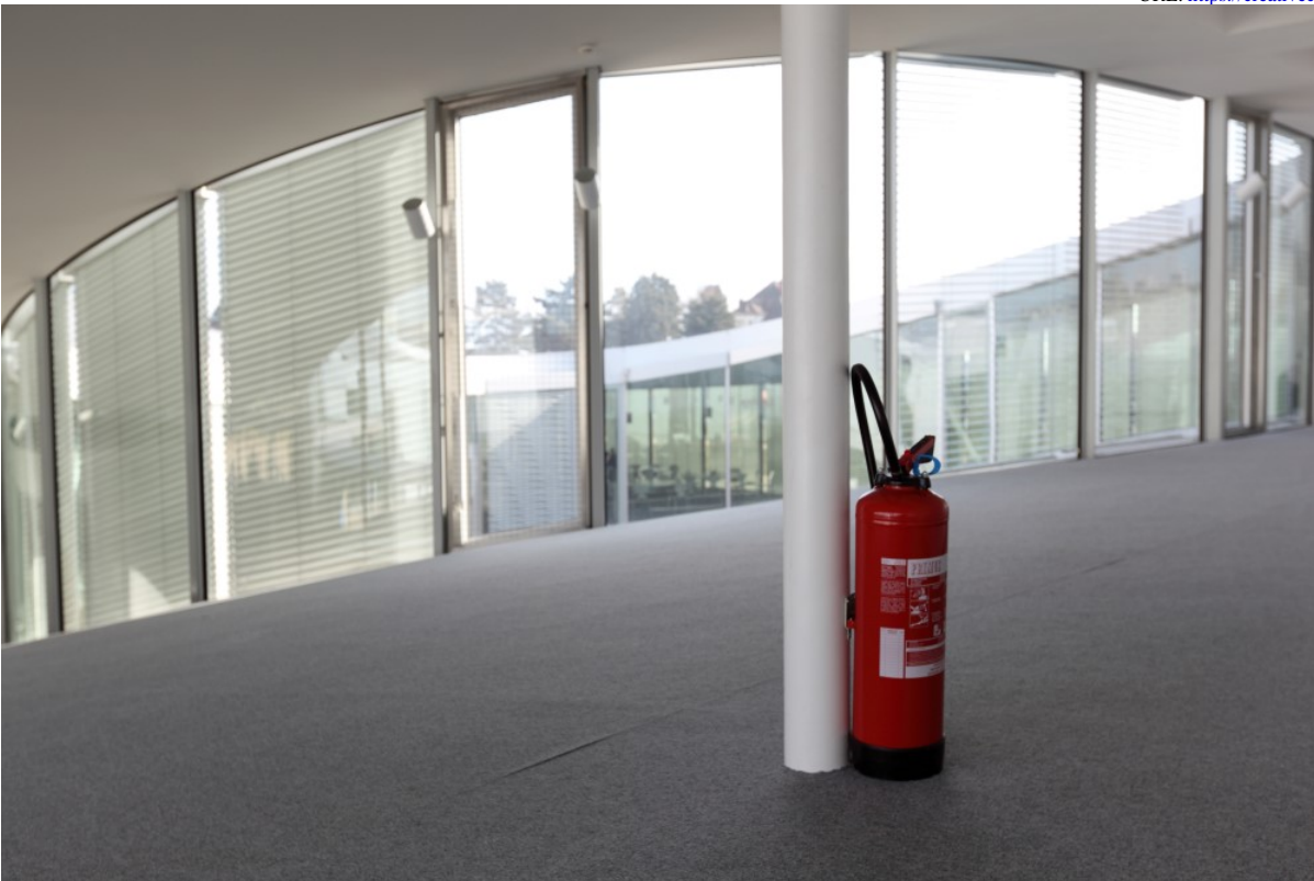
Adreina Schoeberlein / CC BY-NC-ND 2.0