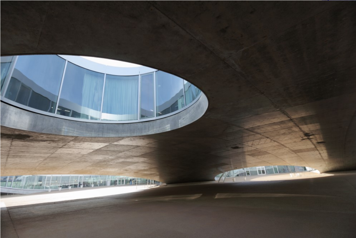
Adreina Schoeberlein / CC BY-NC-ND 2.0