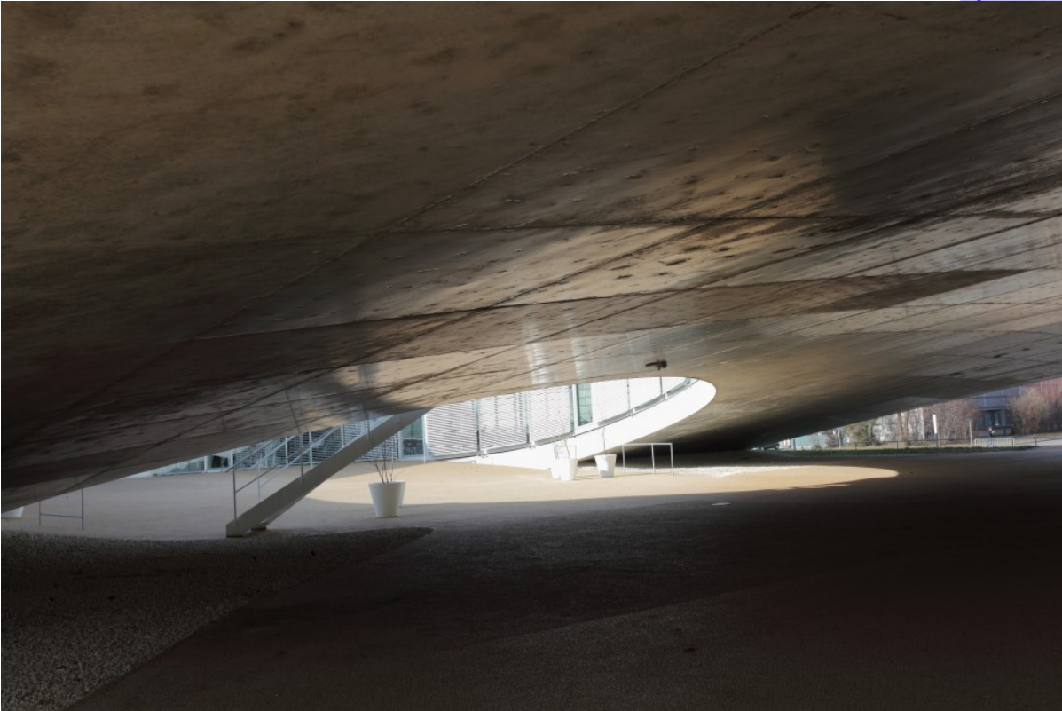
Adreina Schoeberlein / CC BY-NC-ND 2.0