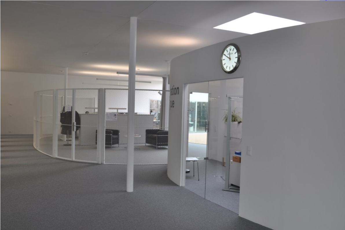
Sasha Cisar / CC BY-ND 2.0