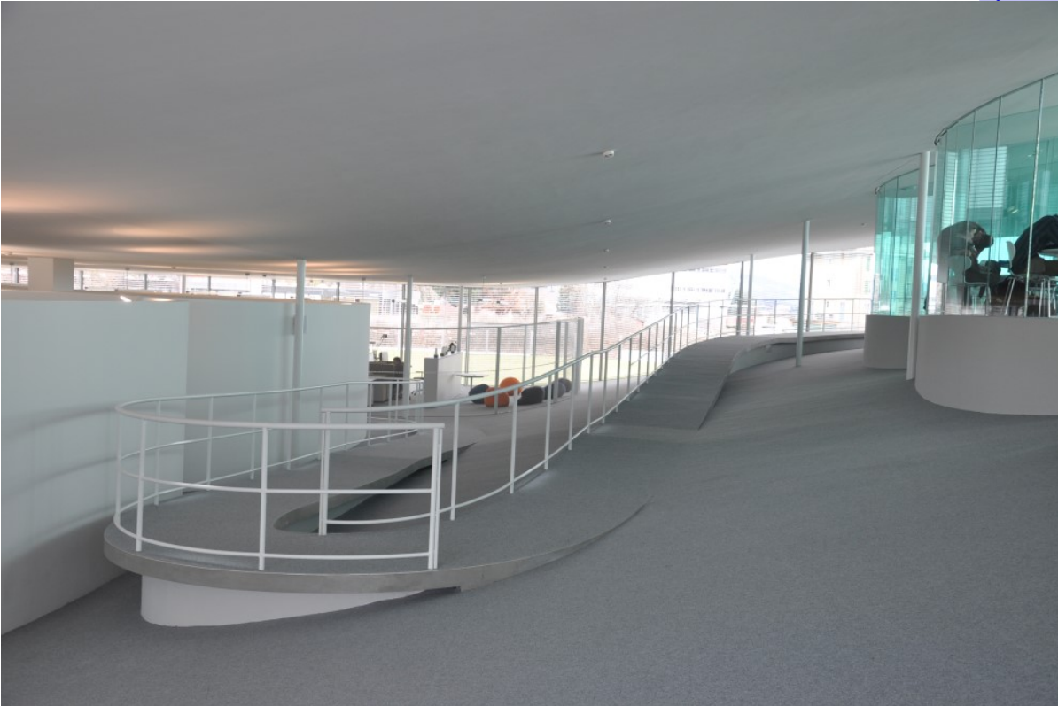
Sasha Cisar / CC BY-ND 2.0