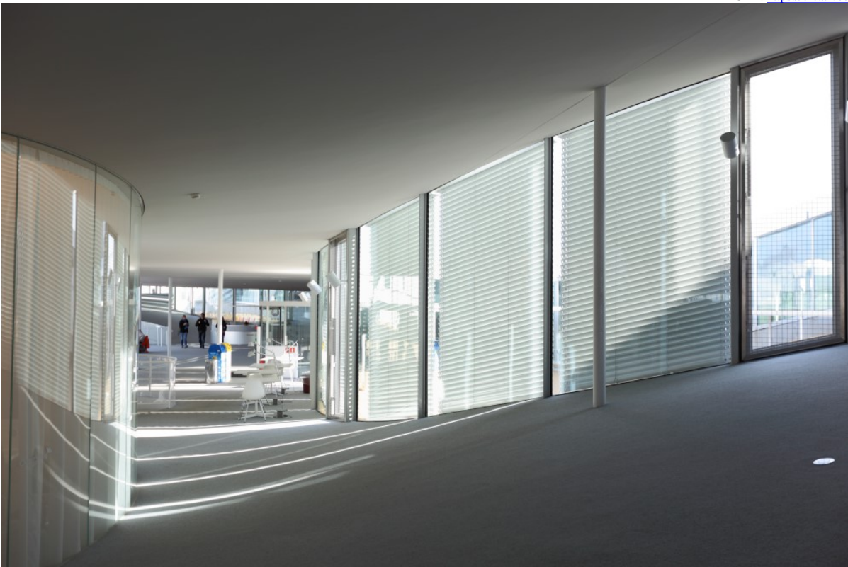
Adreina Schoeberlein / CC BY-NC-ND 2.0