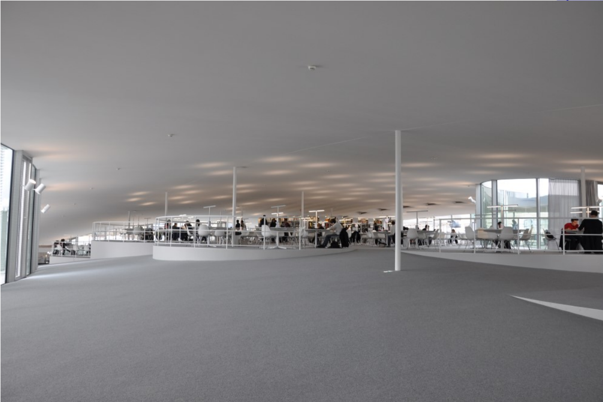
Sasha Cisar / CC BY-ND 2.0